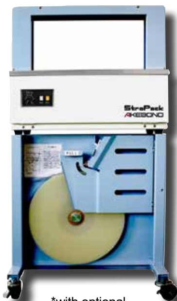
*with optional Large dispenser stand