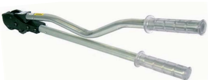
CHART OF TYPES