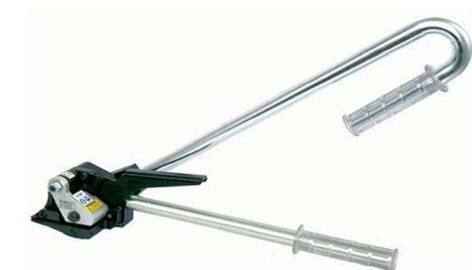
CHART OF TYPES