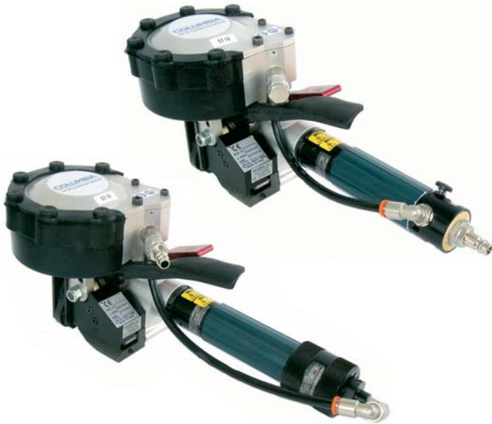
CHART OF TYPES