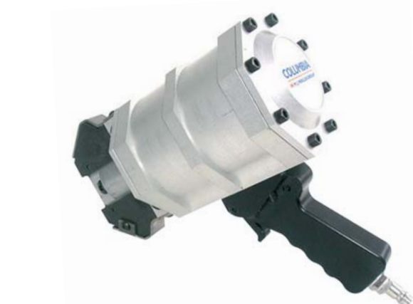
CHART OF TYPES