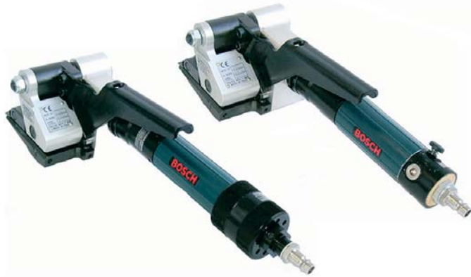
CHART OF TYPES