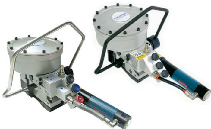
CHART OF TYPES