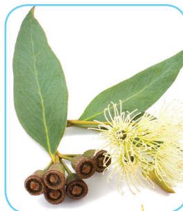
Eucalyptus oil: a powerful expectorant, it promotes the fluidification of mucus.