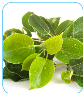
Natural Camphor: decongesting and calming properties.

the presence of bacteria and viruses, and improve animal breathing. This means a reduced risk of respiratory complications, contributing to the general well-being and optimal growth of animals.