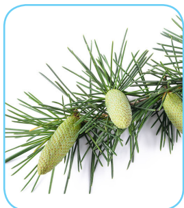
Pine Oil: a natural antiseptic that supports the respiratory tract.