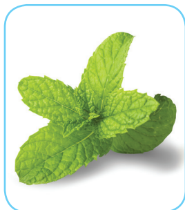
Peppermint essential oil: helps clear the respiratory tract and gives a feeling of freshness.