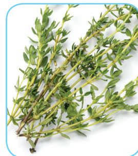
Thyme oil: a natural antimicrobial, protecting the respiratory tract.